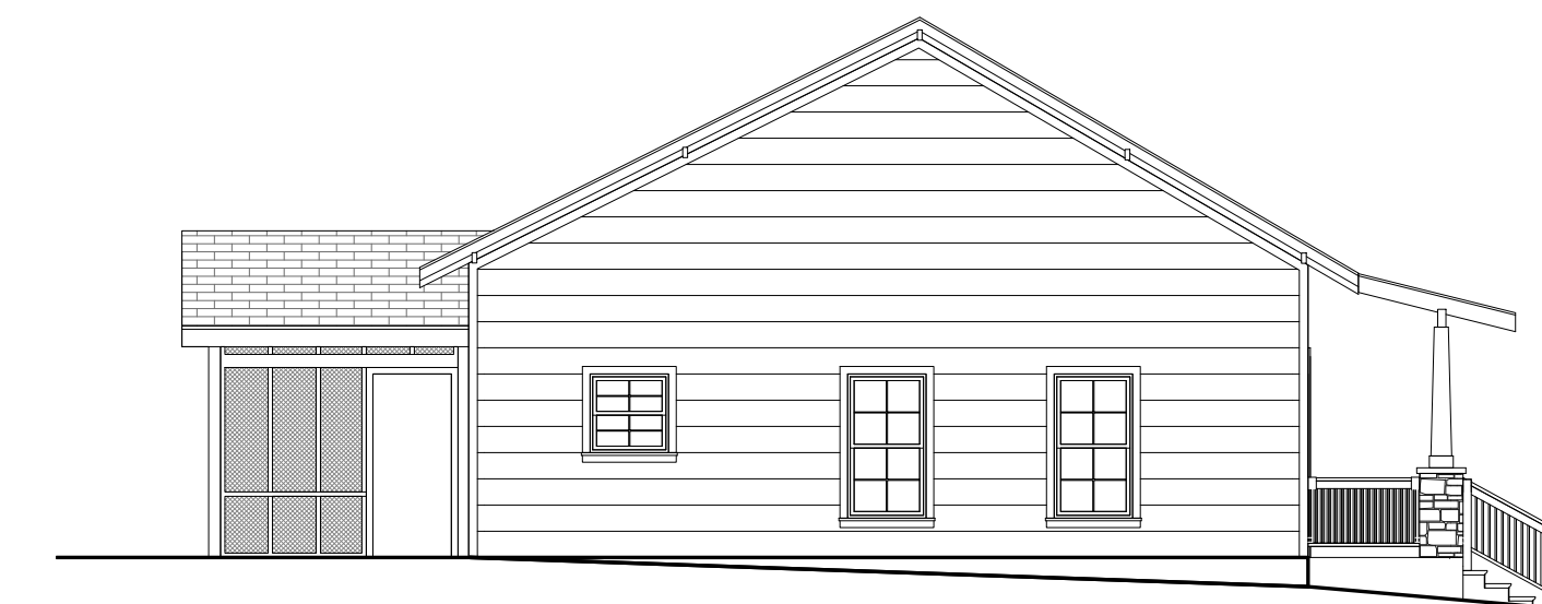
④ WEST 1/8" = 1'-0"