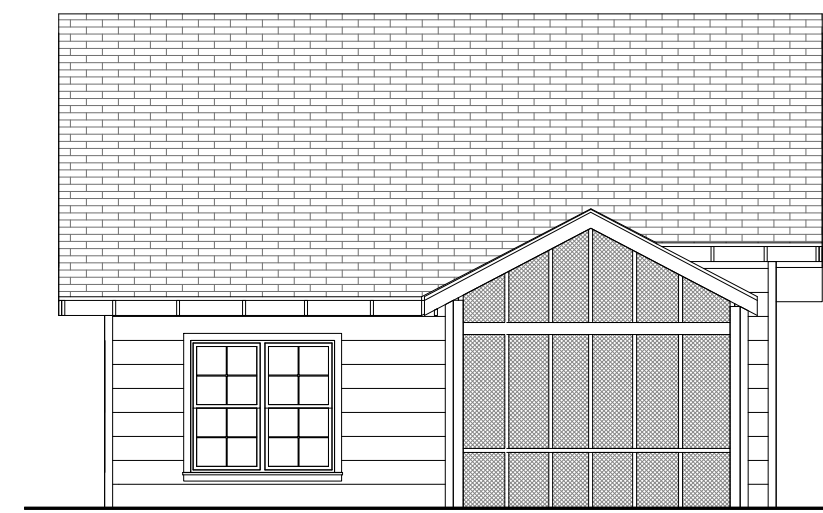
① NORTH 1/8" = 1'-0"