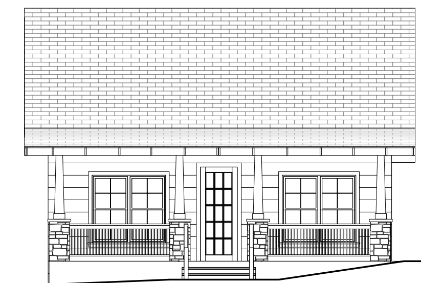
③ SOUTH 1/8" = 1'-0"