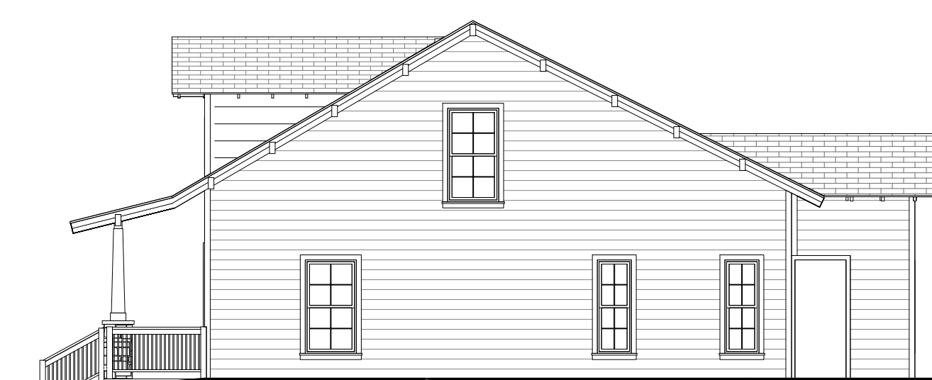
② EAST ELEVATION 1/8" = 1'-0"