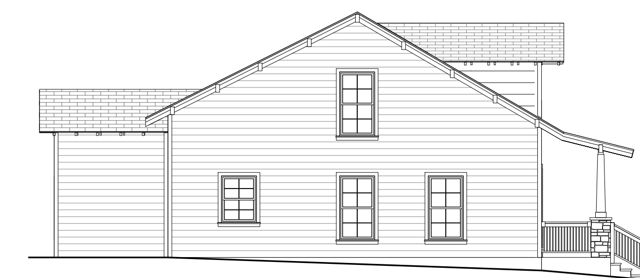
④ WEST ELEVATION 1/8" = 1'-0"