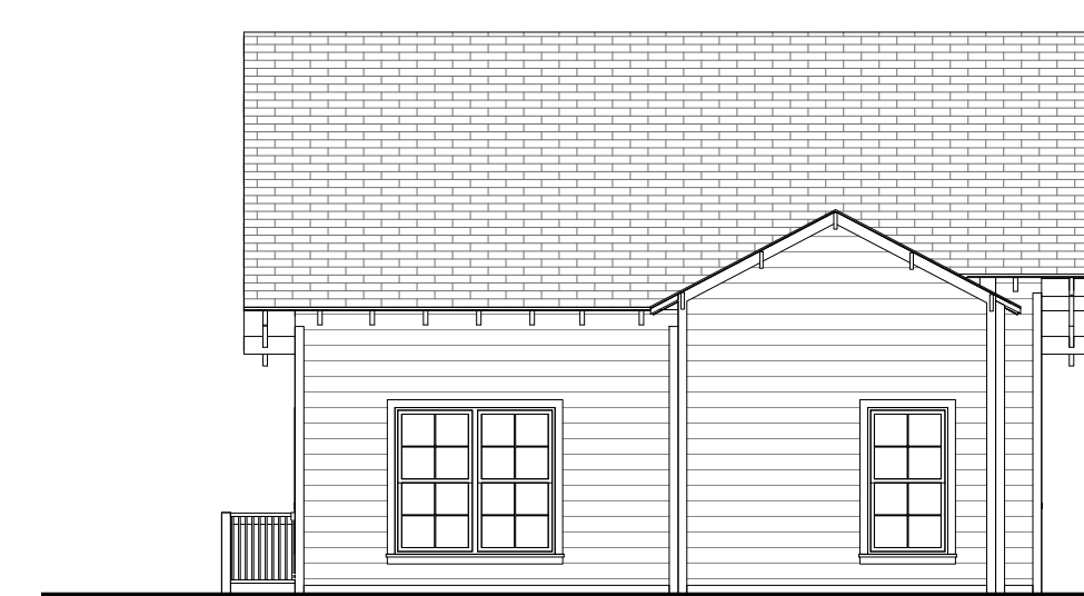
① NORTH ELEVATION 1/8" = 1'-0"