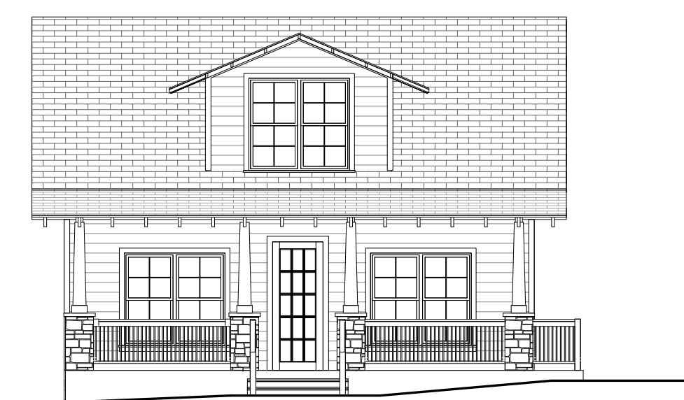
③ SOUTH ELEVATION 1/8" = 1'-0"